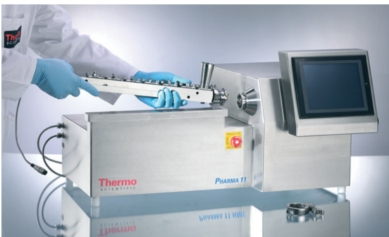
Easily remove and replace the barrel of the Pharma 11

Testing of different formulations and associated validation documentation is quick and easy. High resolution torque measurement and PAT measurements such as FTIR are additional options easy to integrate.