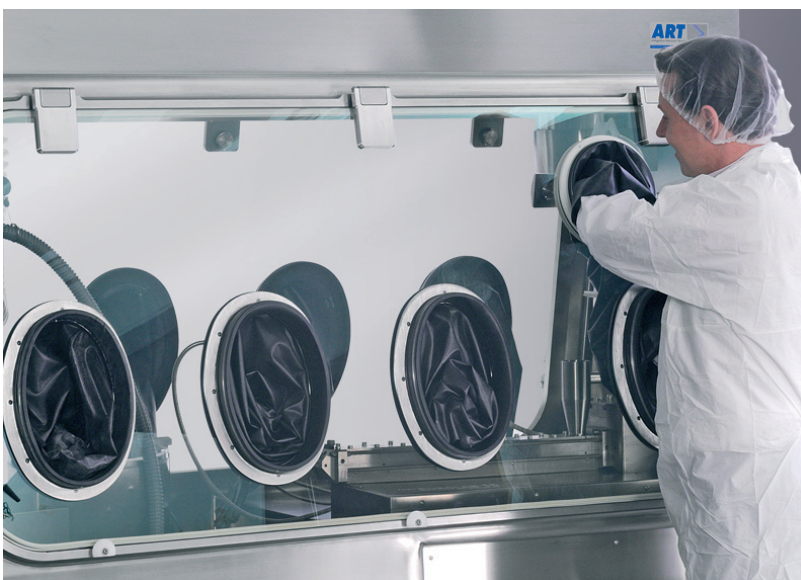
Thermo Scientific Pharma 11, the perfect fit for isolator applications

With the unique monocoque, fanless design complete with electronics fully integrated into the unit itself, no additional cabinet is required and the unit can simply be rinsed with water (IP54) to avoid any dust formation.